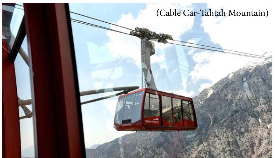
(Cable Car-Tahtalı Mountain)

The preferable season for golf in Antalya is the time between October to May.