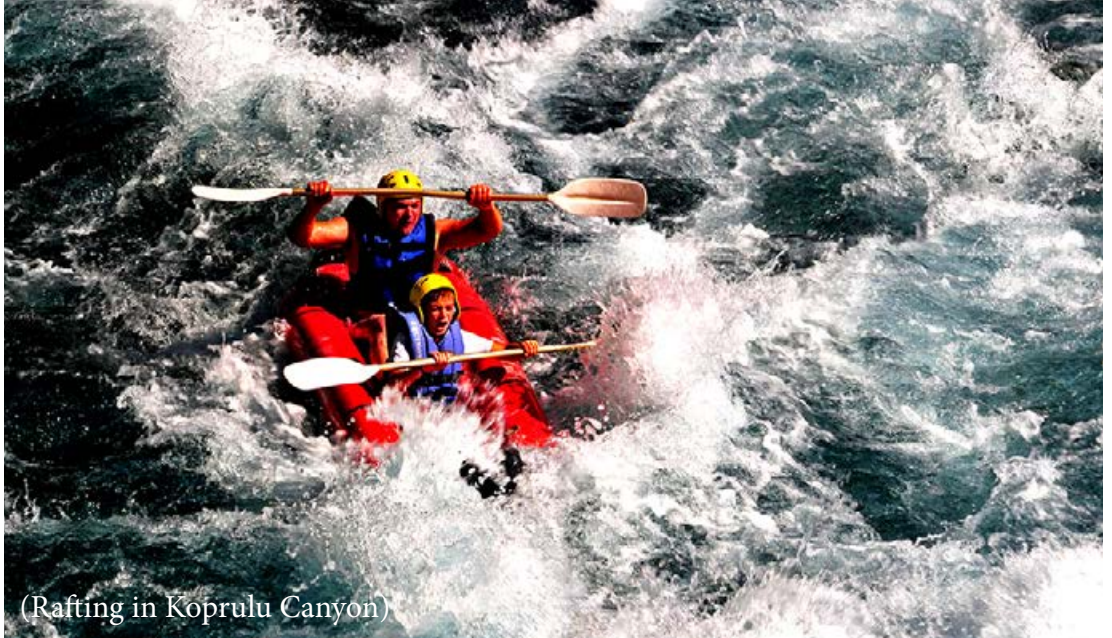
(Rafting in Koprulu Canyon)

It is a daily tour including lunch and transfers where one can have the rafting experience with his/her family and friends.