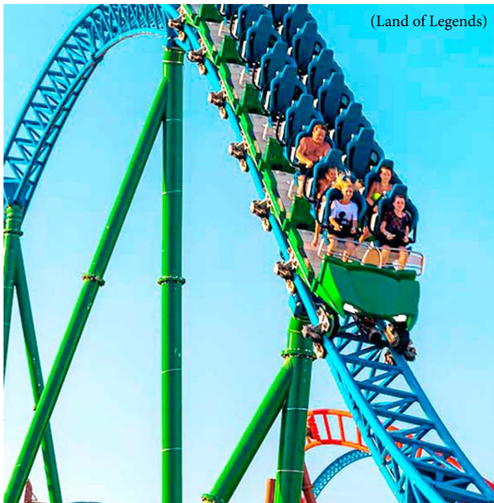
(Land of Legends)

● Jeep Safari: Striking contrast between the beaches and the towering Taurus Mountains in the background makes Antalya and surrounding areas so attractive.