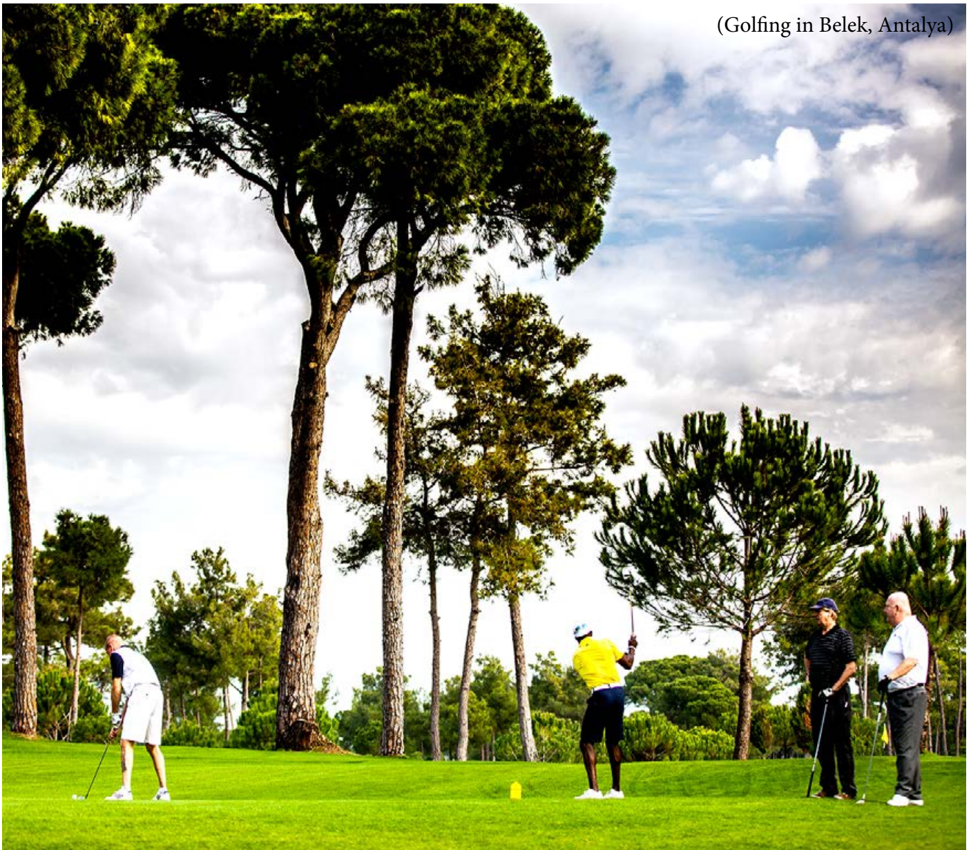
(Golfing in Belek, Antalya)

● Antalya features some of the Mediterranean's cleanest beaches which makes the destination the perfect holiday destination for travelers who love to relax and sunbathe.