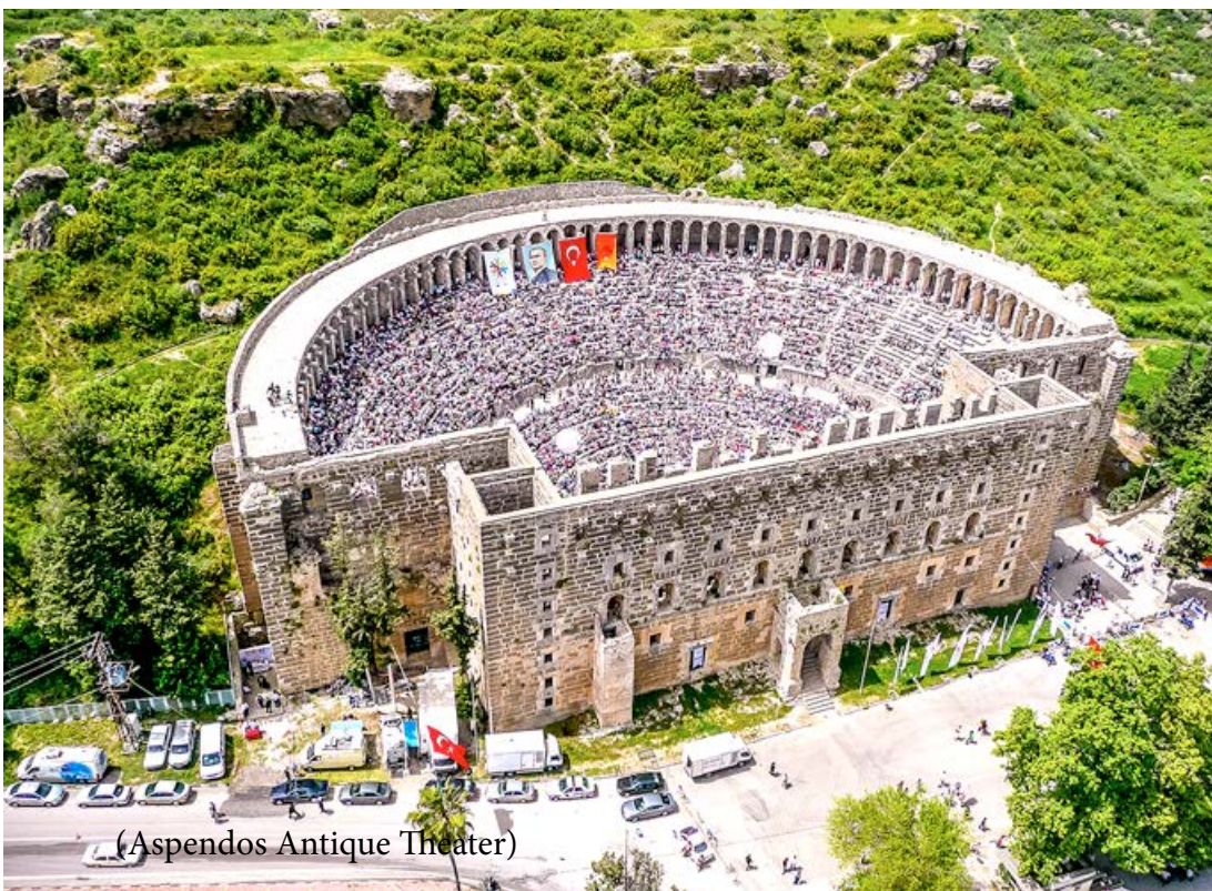
(Aspendos Antique Theater)

In addition to these, "Patara Ancient City", "Myra Ancient City" and "Church of St. Nicholas" which is also known as Santa Claus attract lots of visitors from all around the world.