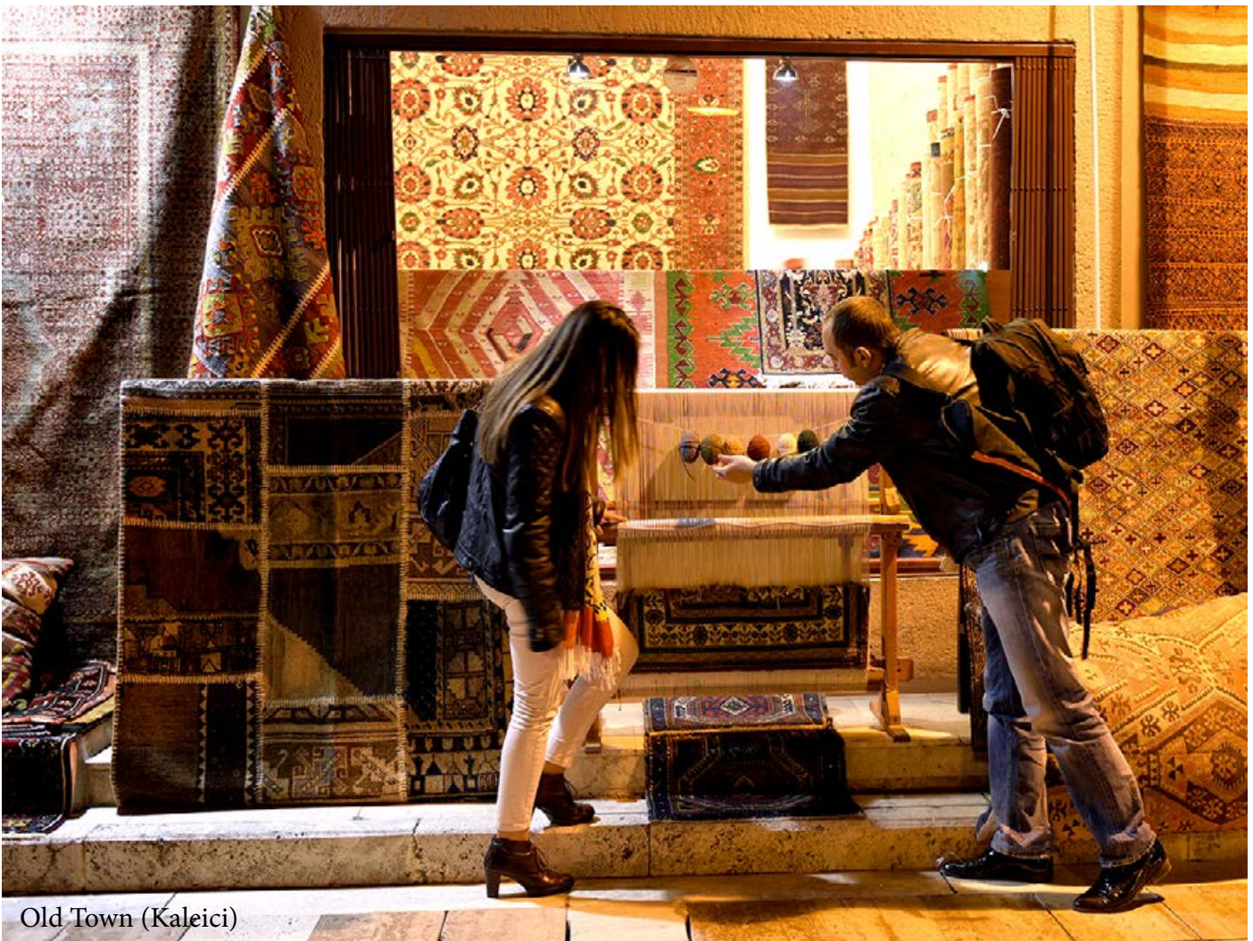
Old Town (Kaleici)

In addition to these, almost all 5 star Hotels in the region have their own shopping facilities.